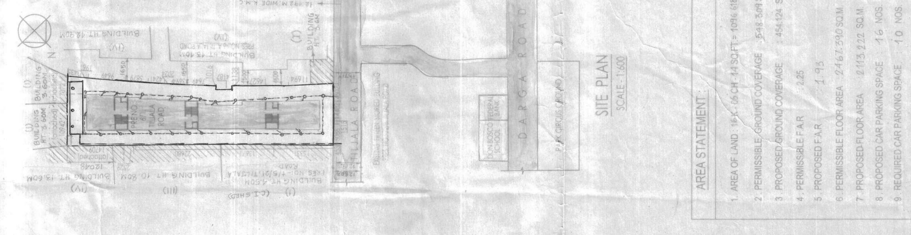
SITE PLAN SCALE: 1:1000